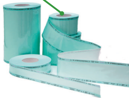
STERIDIAMOND FLAT REELS 100 M